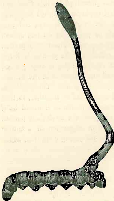
FIG. 30.— Cordyceps Gunnii , from Tasmania.

1848, when it was described and figured, since which period it has been several times found both in Tasmania and in parts of Australia. "The stem, with caterpillar attached, is