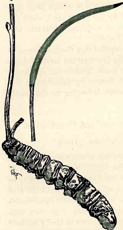
FIG. 29.— Cordyceps Robertsii on New Zealand caterpillar.

The caterpillars feed on Convolvulus batatas ; the Sphæria Robertsii is found parasitical on this cater-