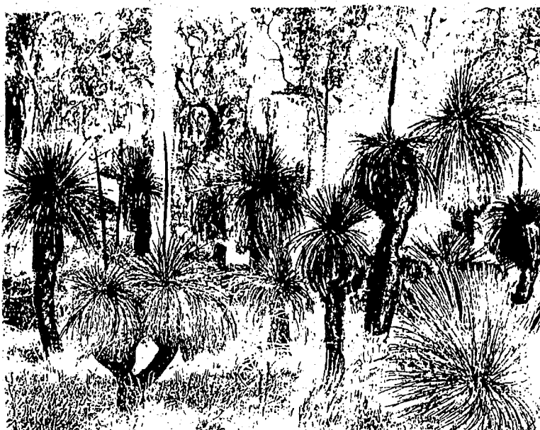
Australian Systematic Botany Society