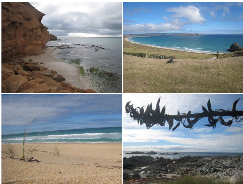
Fig. 2. Chatham Islands habitat: Waitangi harbour (upper left corner), Waitangi beach (upper right corner), Hapupu Reserve (lower left corner) and Point Munning (lower right corner).