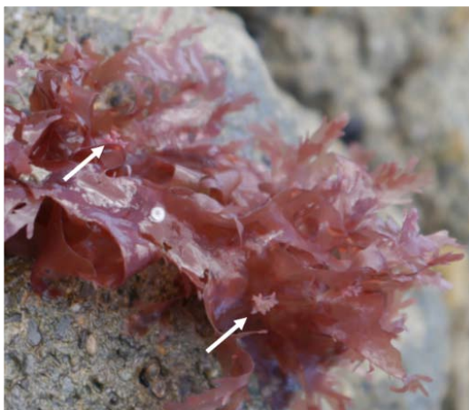
Fig. 1. Rhodophyllis parasitica (indicated by white arrows) growing on Rhodophyllis membranacea .

There are currently ten, mostly poorly described, red algal parasites in New Zealand but the diversity is suspected to be much higher. Previous field trips on the South Island and North Island in New Zealand and herbarium searches at the Museum of New Zealand Te Papa Tongarewa revealed several undescribed parasites. This shows that the biodiversity of red algal parasites is under-represented and that many parasite and host combinations can be used for phylogenetic comparisons and need describing.