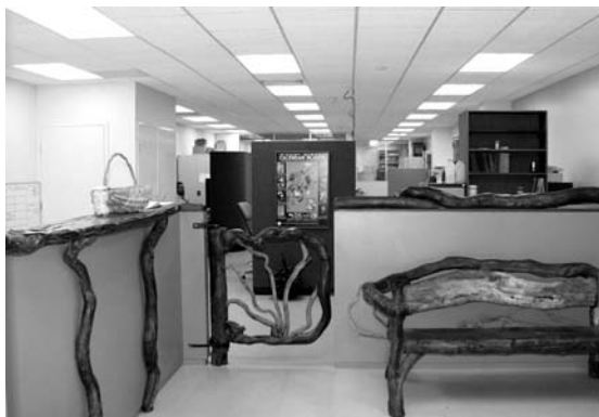
Front counter area of new Herbarium.